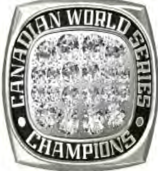
Large Sliver Lustrium/ Bling Top