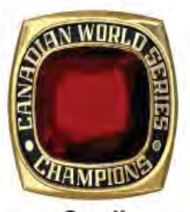
Small Gold Lustrium/Red Stone